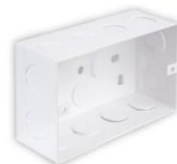
metal in-wall housing included